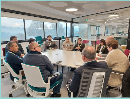
Picture 1. Spanish Workshop

in the beginning of the project, the partners implemented their first national workshops in all 5 European countries of the consortium ( Italy, Portugal, Greece, Spain and Slovakia ).